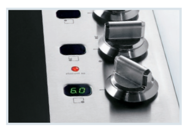
Pro-Select<sup>™</sup> Controls Precise control at your fingertips.